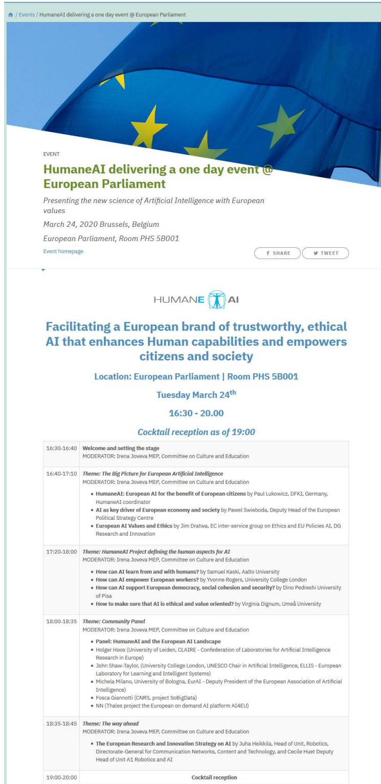
Figure 3: Event page on official website