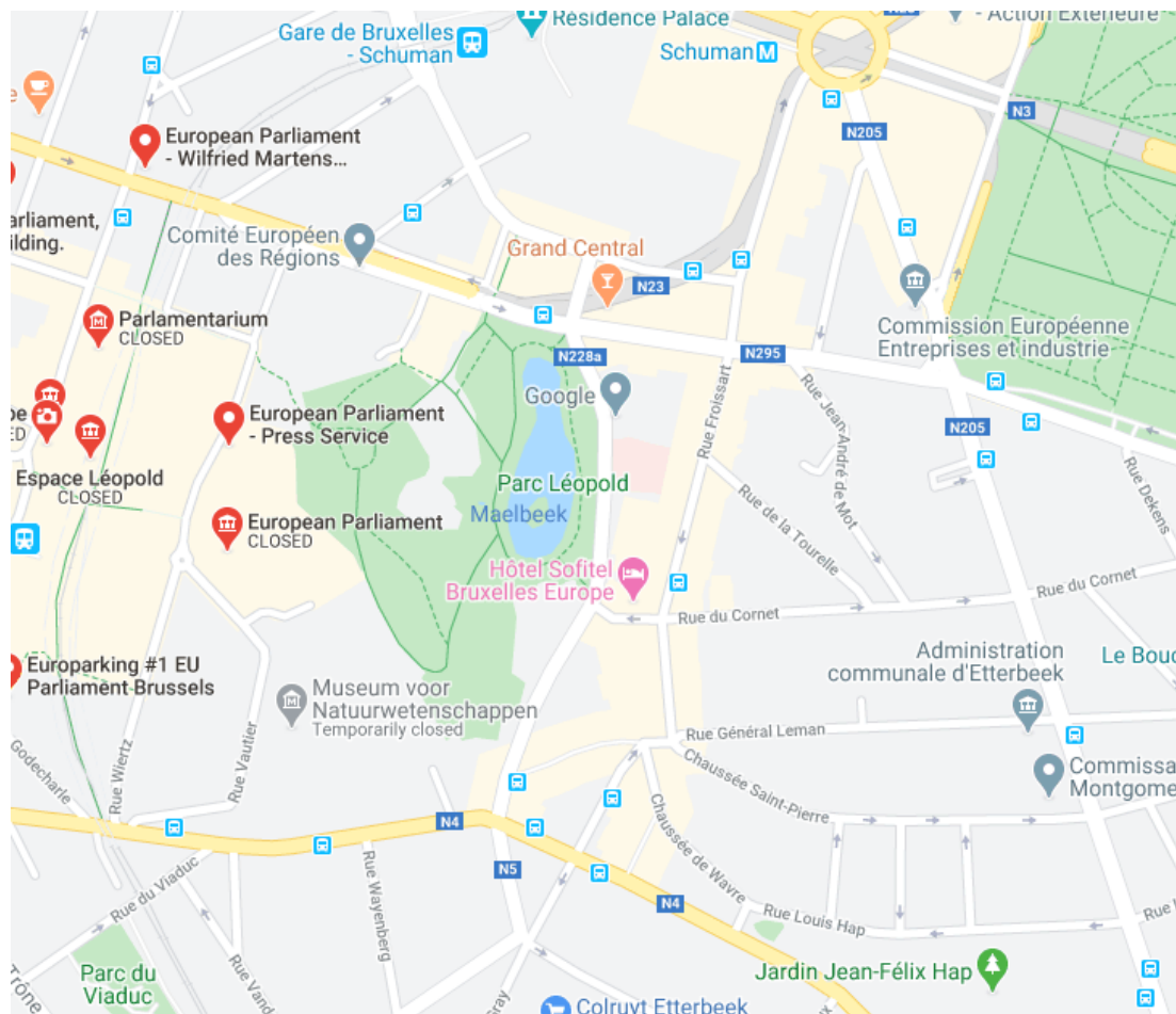
Figure 1: Event location at the European Parliament

The meeting was to be held on 24 th March, 2020 in Brussels, Belgium, at the European Parliament, Room PHS 5B001. See map of the venue below (Figure 1).